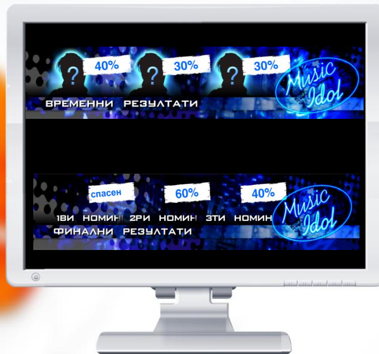
Flash application MUSIC IDOL