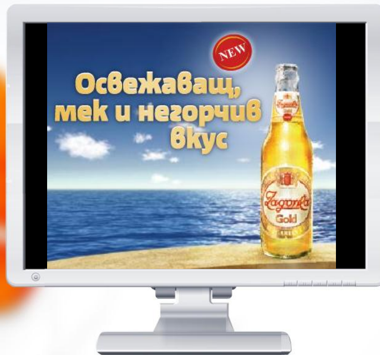
Banner Ads. Zagorka Gold