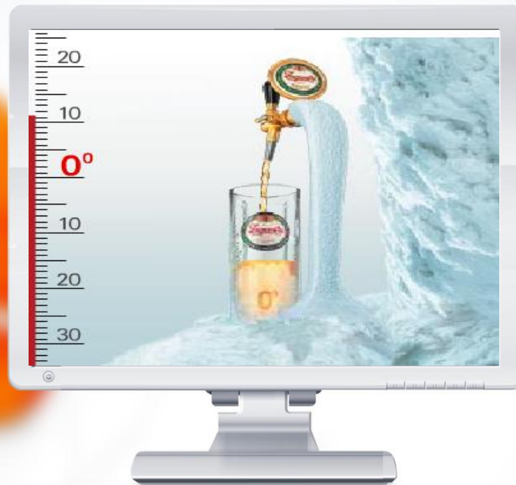
Banner Ads. Zagorka Ice Cold