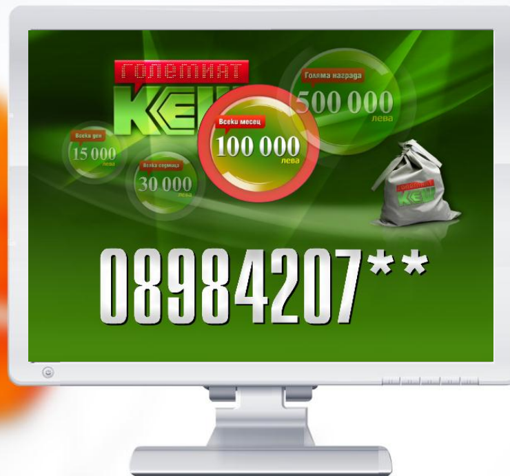
Flash application BIG CASH